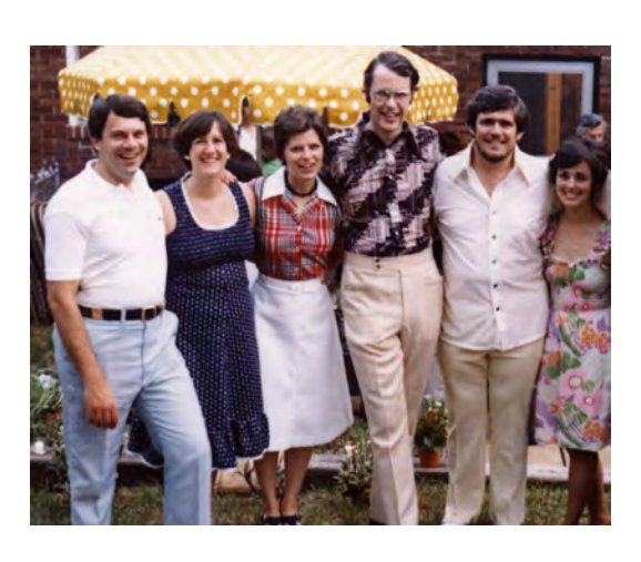
THE SAME HAPPY GROUP IN 1977