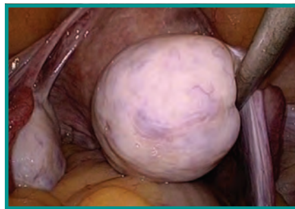
Surgical image of an ovarian cyst.

by learning how to chart the menstrual cycle. If a woman is charting the Creighton Model System , she will be able to identify a longer than normal post-ovulatory phase which can sometimes signal an ovarian cysts presence. If she is also experiencing pelvic pain, this with the charting often correlates with the diagnosis of the cyst. At this point an ultrasound usually is ordered and the cyst is easily seen on the ovaries.