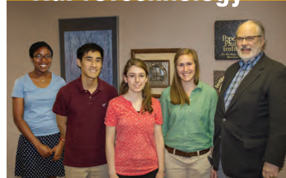
Above: The 2016 Summer Interns at the Pope Paul VI Institute (left to right)