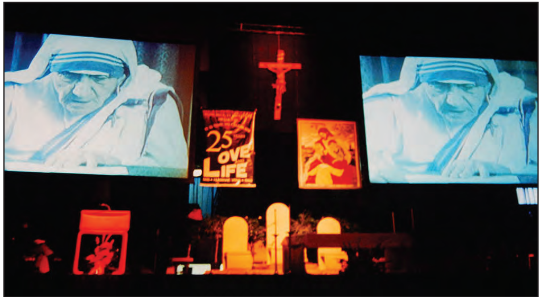
Mother Teresa addresses the crowd of thousands by video in 1993 at the opening mass of the 25th Anniversary of Humanae Vitae in Omaha, Neb. See transcript of video on page 2.

Like us on FACEBOOK facebook.com/PPVI.Institute