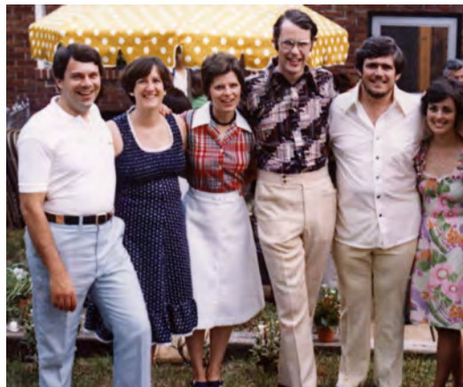
THE SAME HAPPY GROUP IN 1977